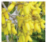
Sophora chathamica .