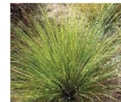
Carex virgata .