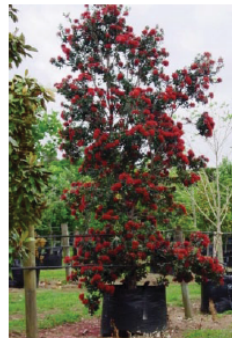
Metrosideros 'maori princess' . Source: rainbowntrees.co.nz