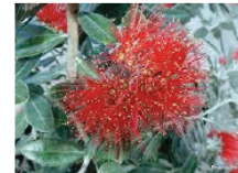
Metrosideros 'maori princess' .